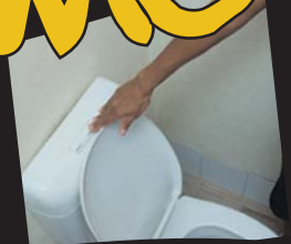
after using the toilet